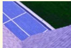
Solar panels on the roof of the Victorian wing