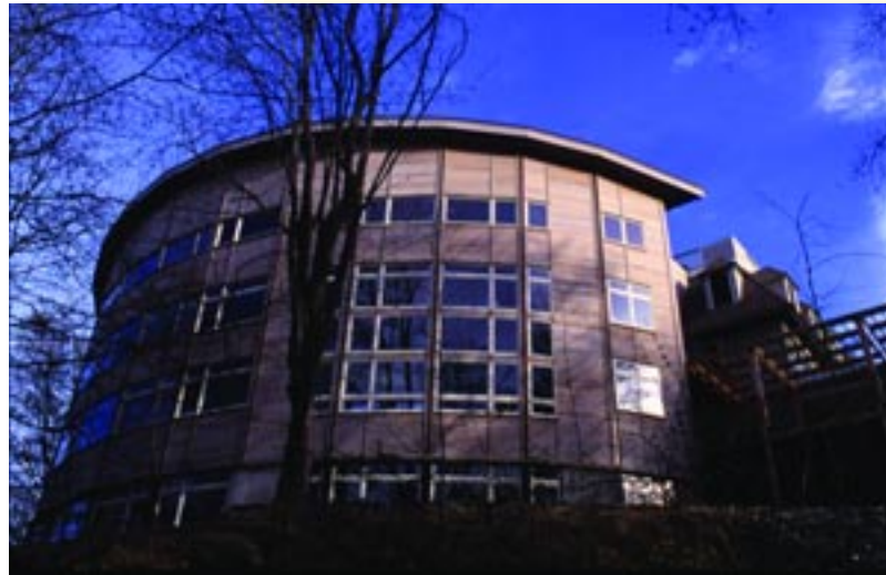
The new curved wing of the Ordway Campus