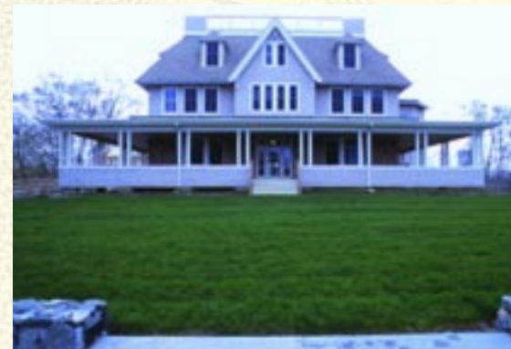
The newly renovated Victorian mansion

In its heyday, Hilltop’s brochure described high ceilings and eleven bedrooms, spacious hallways and living rooms, “and an unobstructed exposure to winds from all directions which makes Hilltop airy and cool.” It boasted nearby tennis, golf, swimming, sailing, both salt and fresh water fishing, and noted that the steamship service from Woods Hole to Martha’s Vineyard and