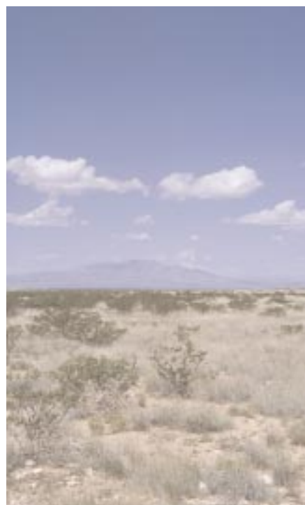
Figure 1 On site — a view of the Sevilleta area, one of the sites where Jackson et al. 3 conduct their long-term research.

When shrubs invade grasslands, carbon input to the topsoil may decrease because the woody species allocate less of their total production below ground, and what they do send to roots is distributed more deeply 9 . Because much of the carbon in soil decomposes slowly, several decades must pass after